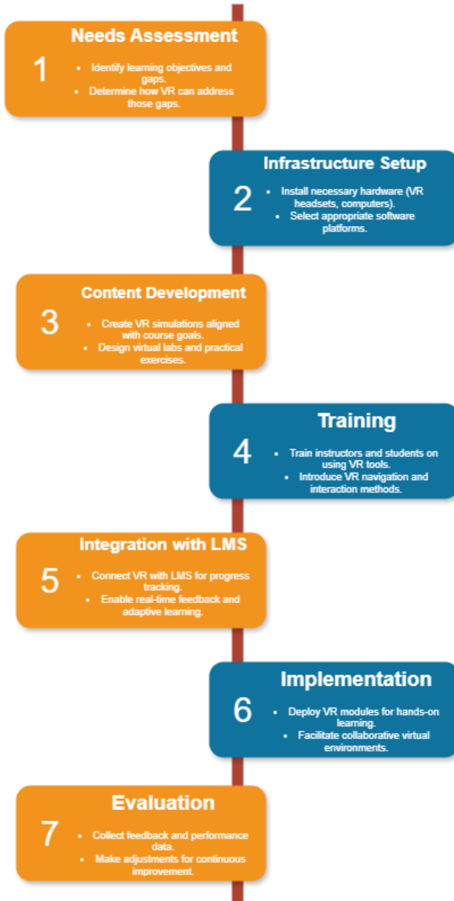
Figure 1: VR in practical instruction